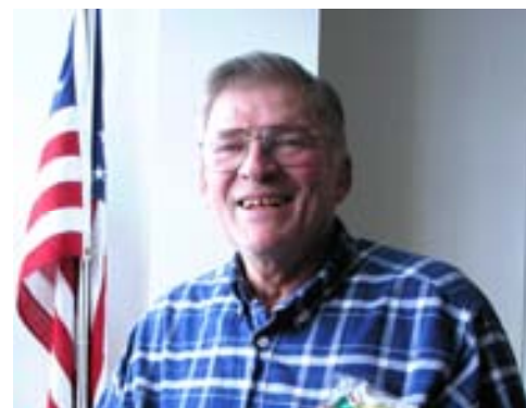
Recognition of honoree prior to dessert